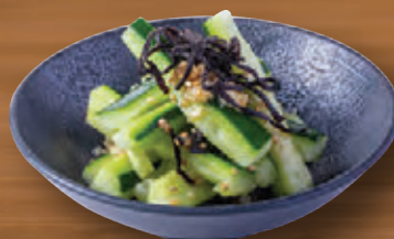
Cucumber with Sesame Oil