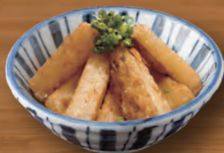
Fried Mountain Yam Stick