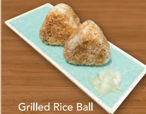
Grilled Rice Ball