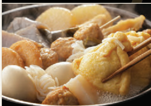
Today's Oden *2pcs per person